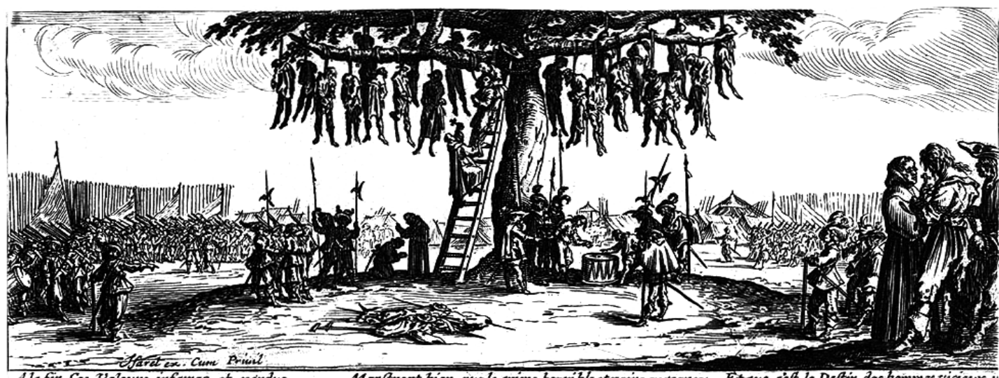
Alafin ses Voleurs infames et perdus Monstrent bien que le crime horrible et noire engeance Estud mesme instrument de houte et de vengeance