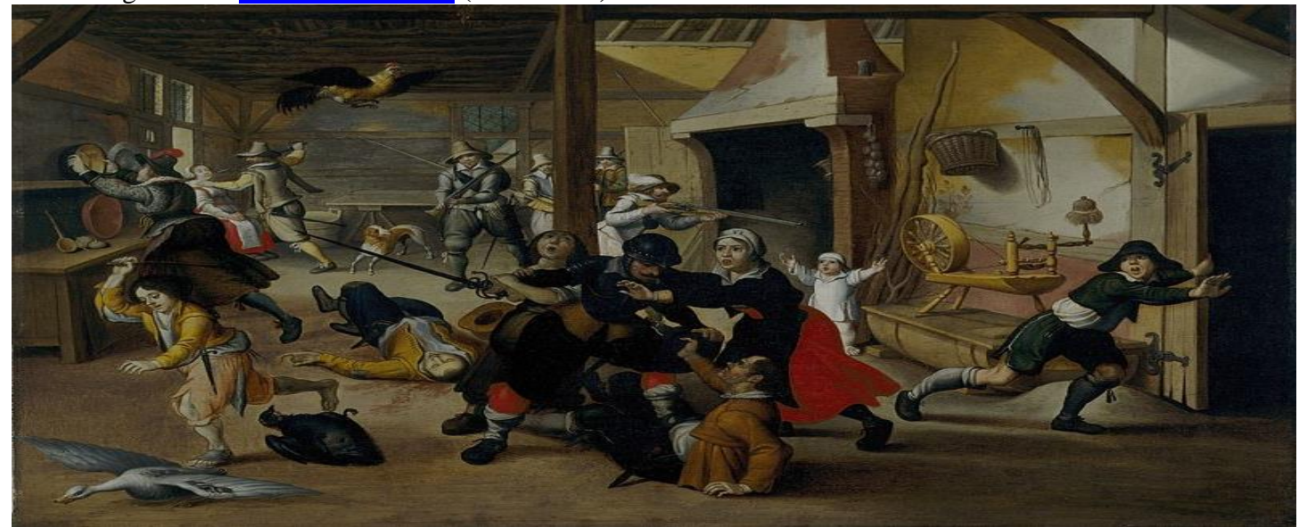
Soldiers plundering a farm during the thirty years' war Sebastian Vrancx (1573–1647 Maurus Fiedsenegger, a Catholic monk, describes the pillage of a Bavarian monastery and its village in 1633 by Protestant soldiers.

"The village, where the soldiers found only empty houses and no people, became a terrible sight. The whole village seemed to be aflame. They took chairs and benches out of the houses, removed roofs, filling the streets with dangerous camp fires and the whole village echoed to their shouts and screams that could only by brought on by their hunger and frustration. Not a single villager who looked on from afar had any hope of seeing his house again when the next day dawned. On the next day the starving soldiers searched the woods and found enough that had been hidden to still their hunger and misery.